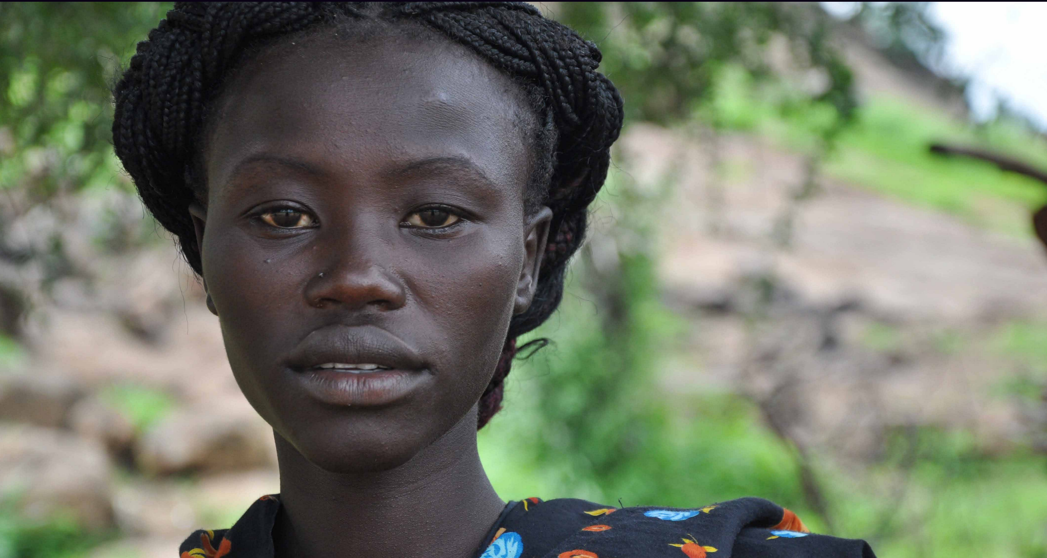
Lomon, Nubske gore, Sudan, 2003 Lomon, Nuba Mountains, Sudan, 2003