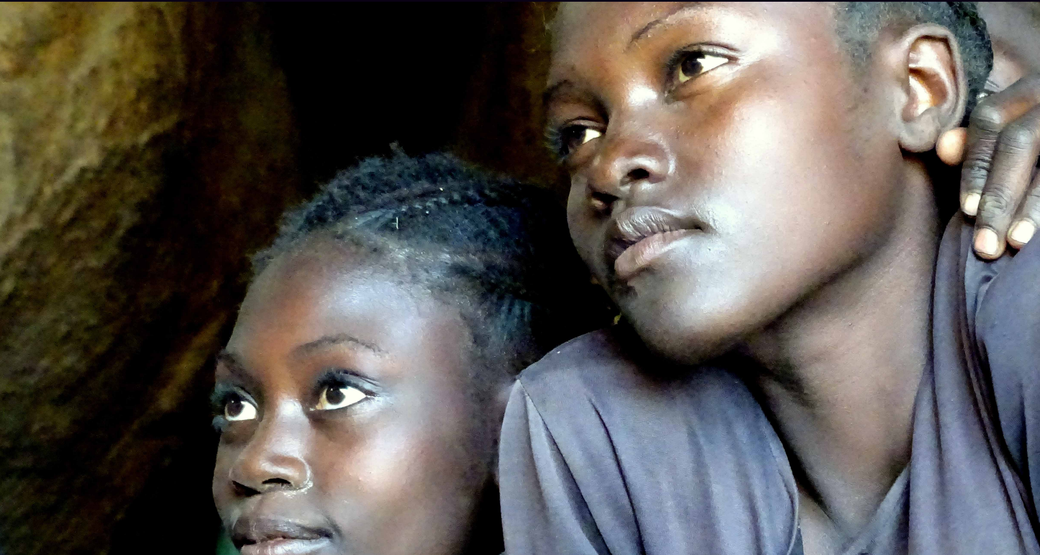
Kowalib, Nubske gore, Sudan, 2016 Kowalib, Nuba Mountains, Sudan, 2016