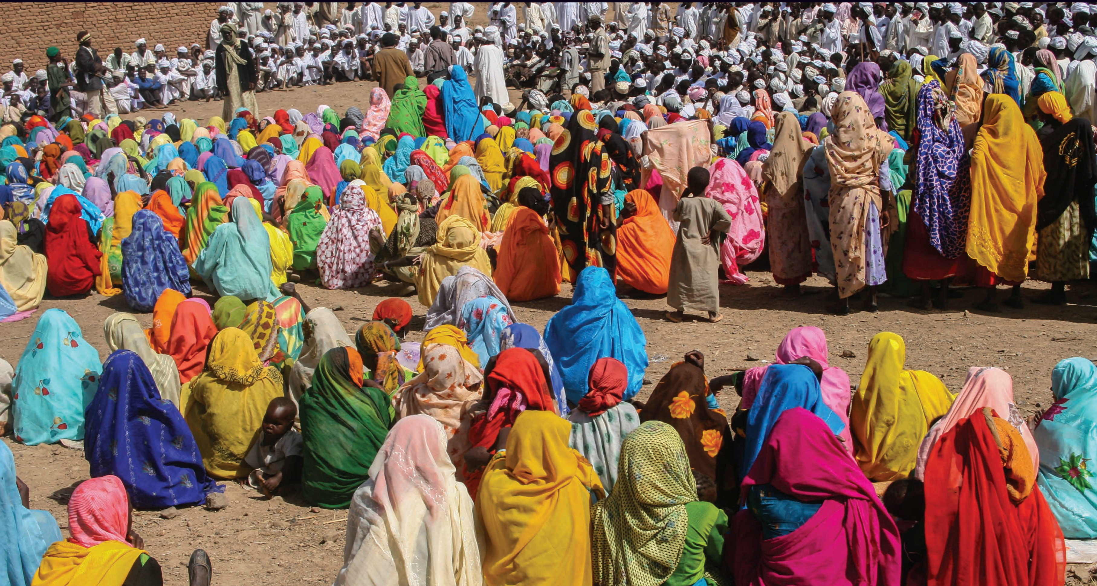
Fur, Darfur, Sudan, 2006 Fur, Darfur, Sudan, 2006