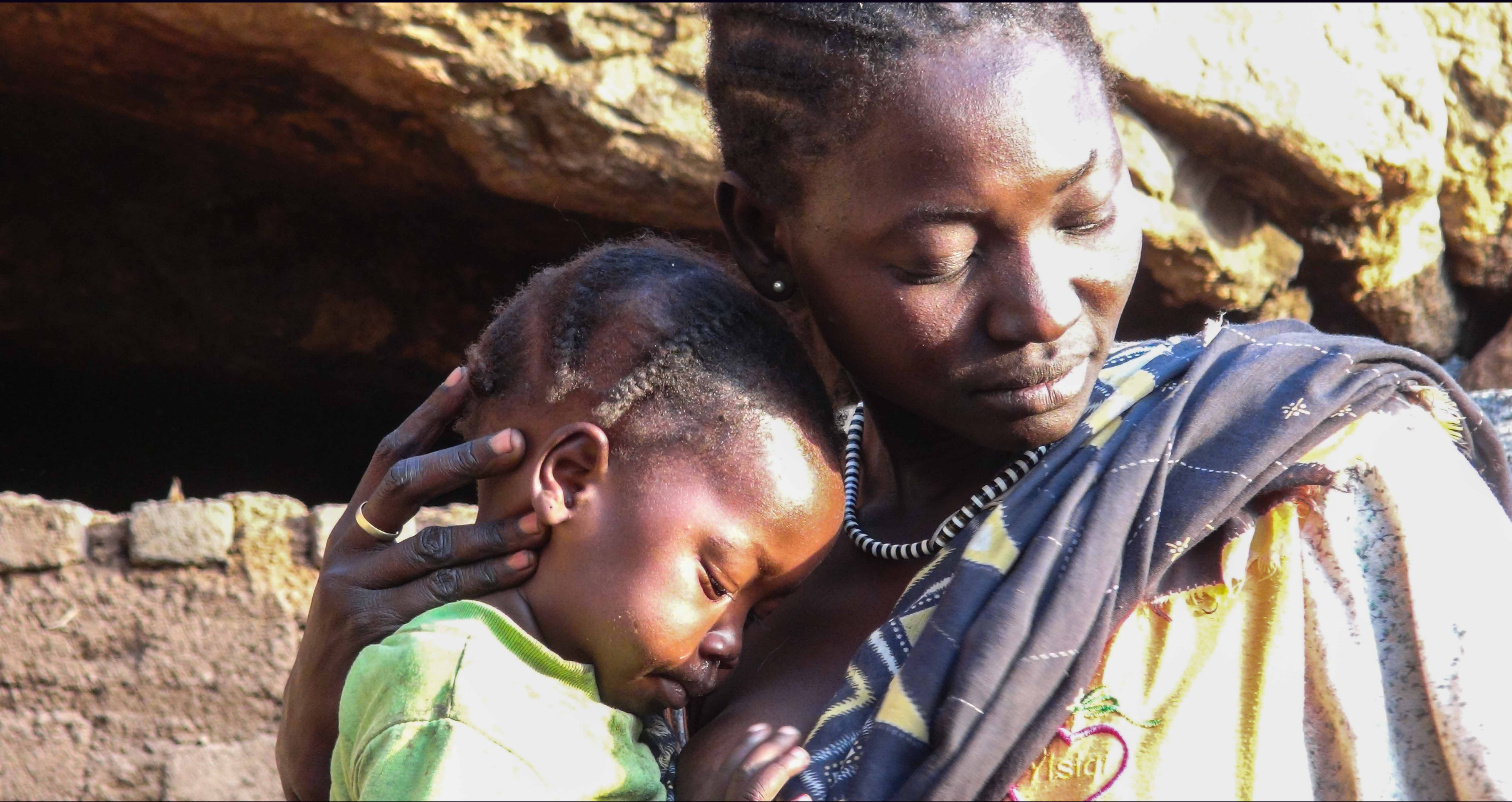
Tira, Nubske gore, Sudan, 2014 Tira, Nuba Mountains, Sudan, 2014