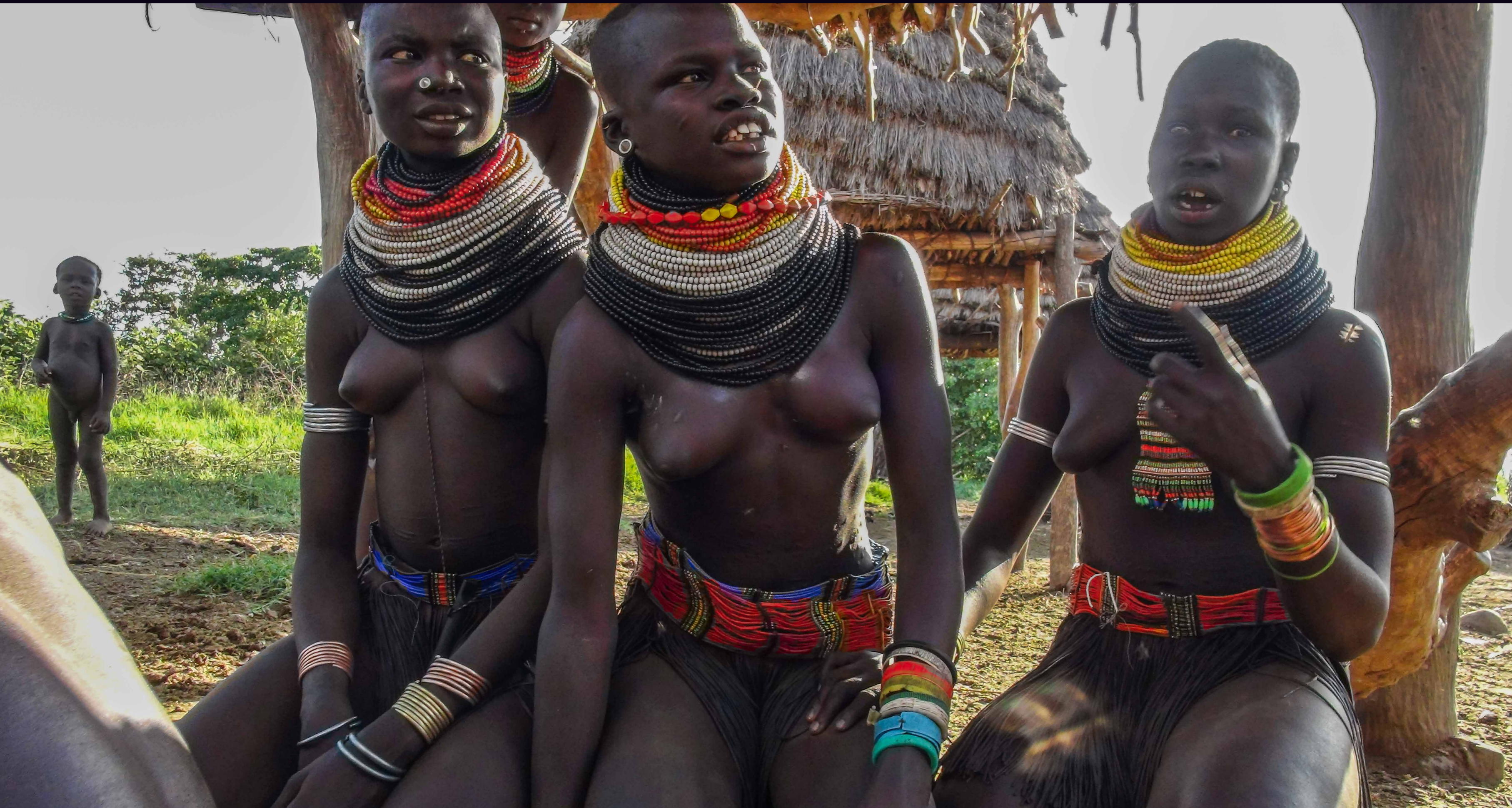
Ngatom, Republika Južni Sudan, 2015 Ngatom, Republic of South Sudan, 2015