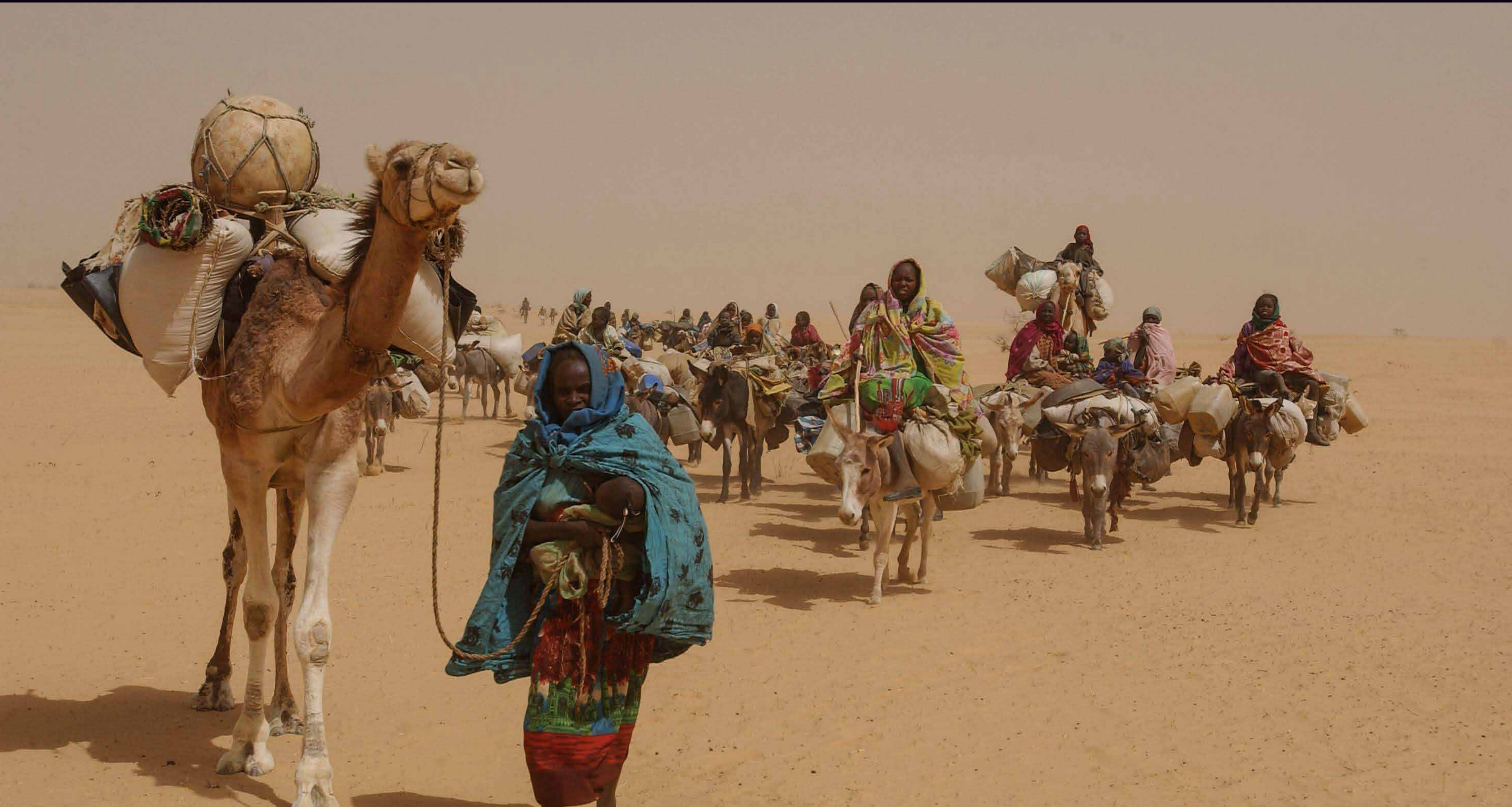
Zaghawa, Darfur, Sudan, 2006 Zaghawa, Darfur, Sudan, 2006