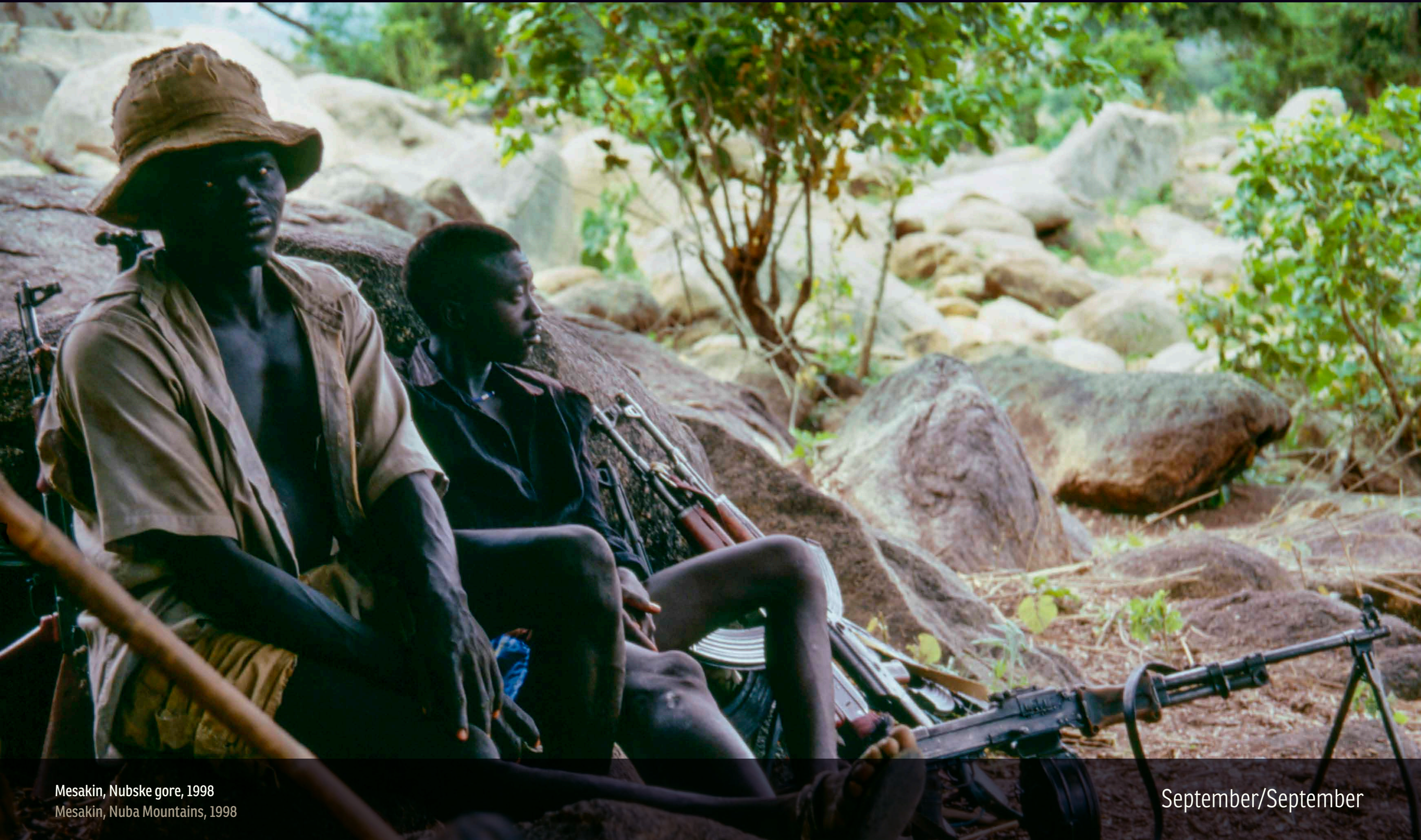
Mesakin, Nubske gore, 1998 Mesakin, Nuba Mountains, 1998