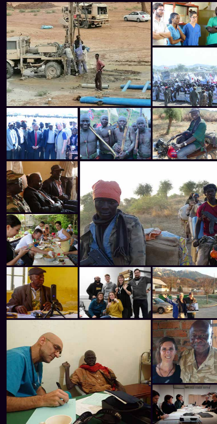
Hvala za sodelovanje vsem prostovoljcem! / Thank you to all volunteers for your cooperation!