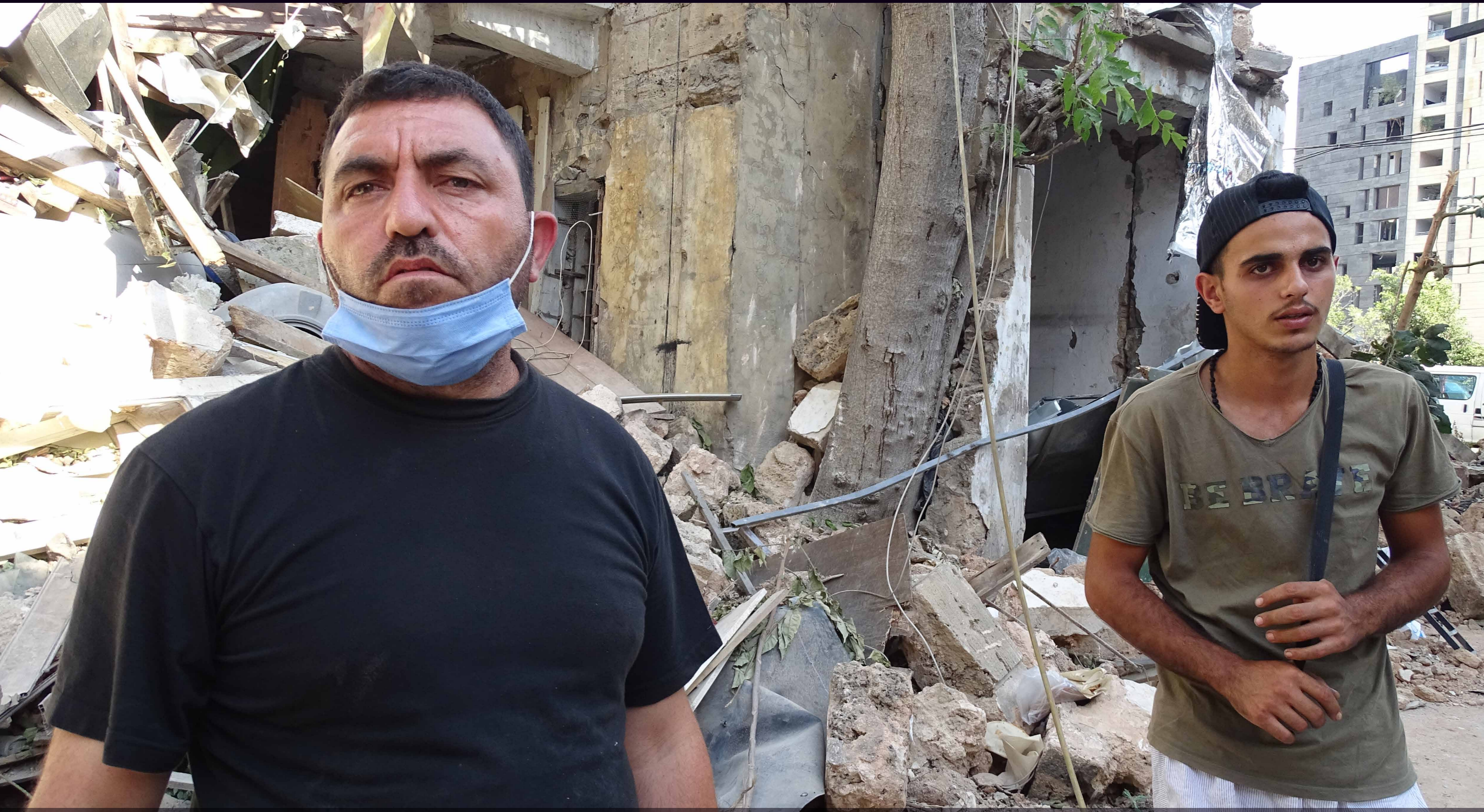
Po veliki eksploziji v bejrutskem pristanišču so tudi meščani ene najstarejših civilizacij prepuščeni sami sebi. After the giant explosion in the port of Beirut, the citizens of one of the oldest civilizations on Earth are also left to their own devices.