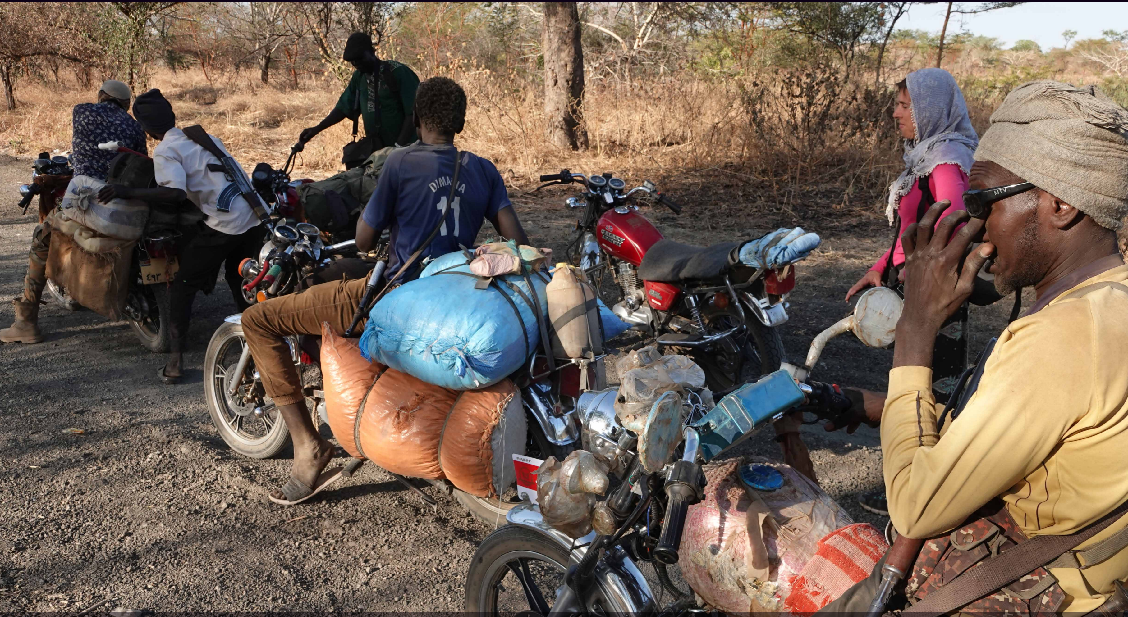
V Zahodne Nubske gore je mogoče priti le na motorjih. Najbolj nevarno je prečkati asfaltno cesto Diling–Kadugli. To pa zato, ker jo nadzorujejo vladne sile. The Western Nuba mountains can only be reached on motorcycle. The most dangerous part is crossing the asphalt road Diling – Kadugli, which is controlled by government forces.