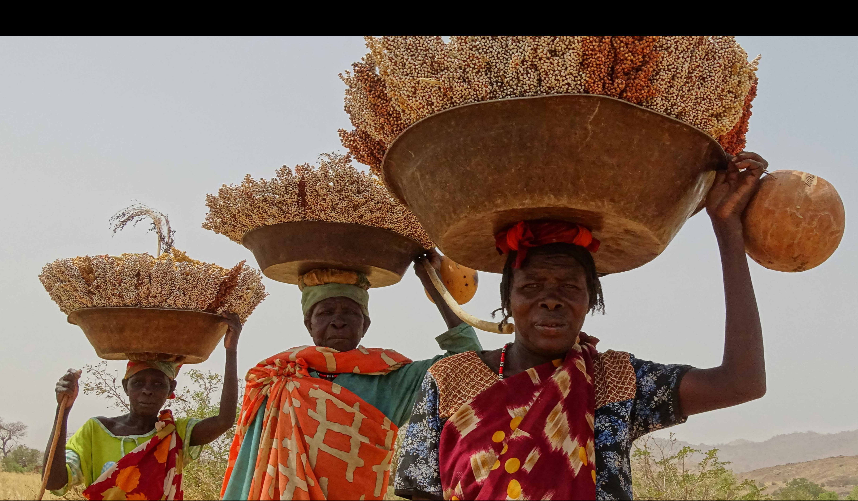
Pri Nubah mlatijo proso moški, veselje in radost ob prenašanju in spravilu prosa v kašče pa je rezervirano za žene in dekleta. Millet is threshed by Nuba men – the mirth and joy of transporting and storing the millet in granaries is reserved for young girls and women.