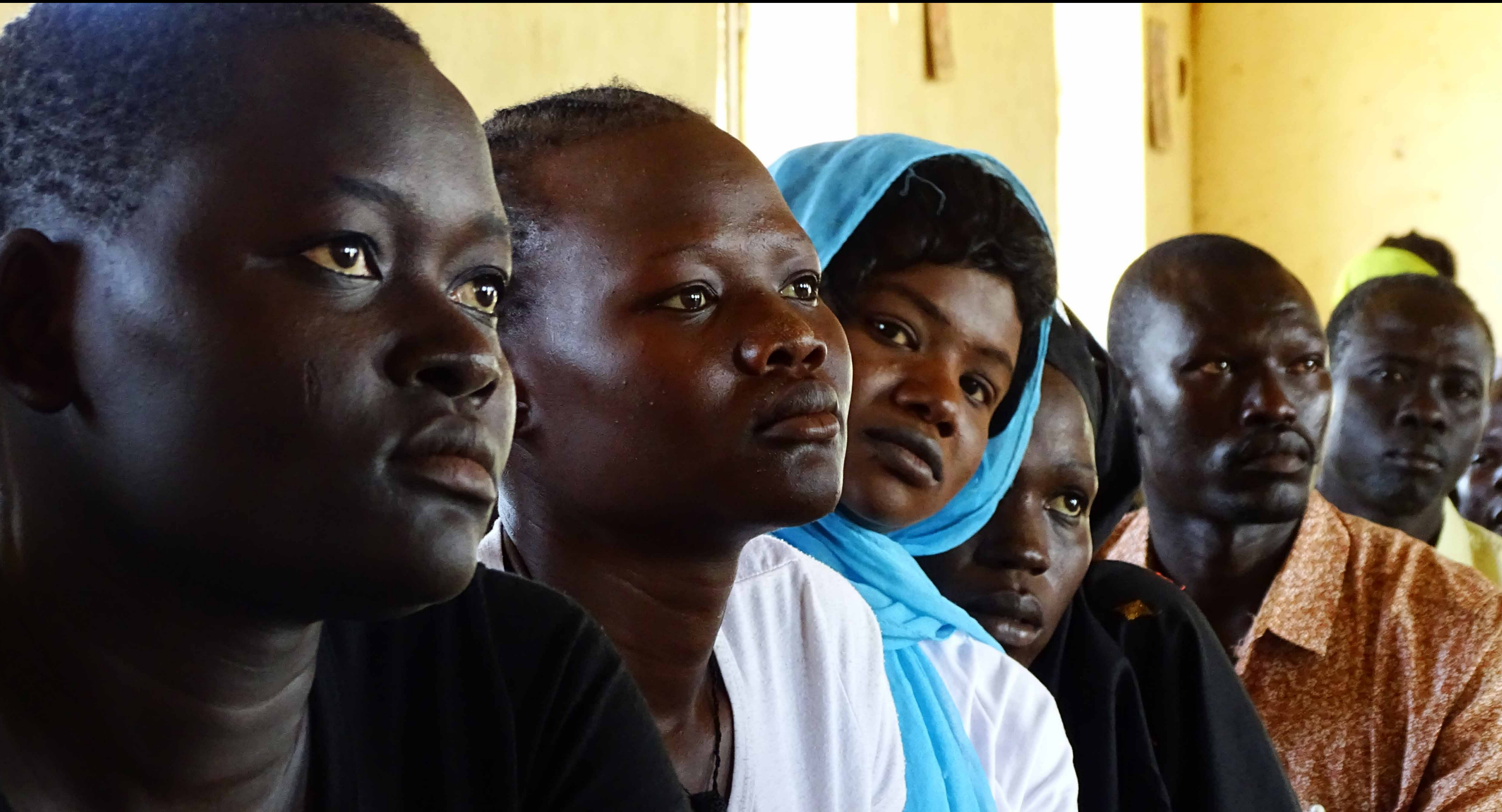
Božič v katoliški cerkvi Matere usmiljenja na osvobojenem ozemlju. Christmas in the small catholic church of the Mother of Mercy on the liberated territory.