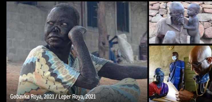
Gobavka Roya, 2021 / Leper Roya, 2021