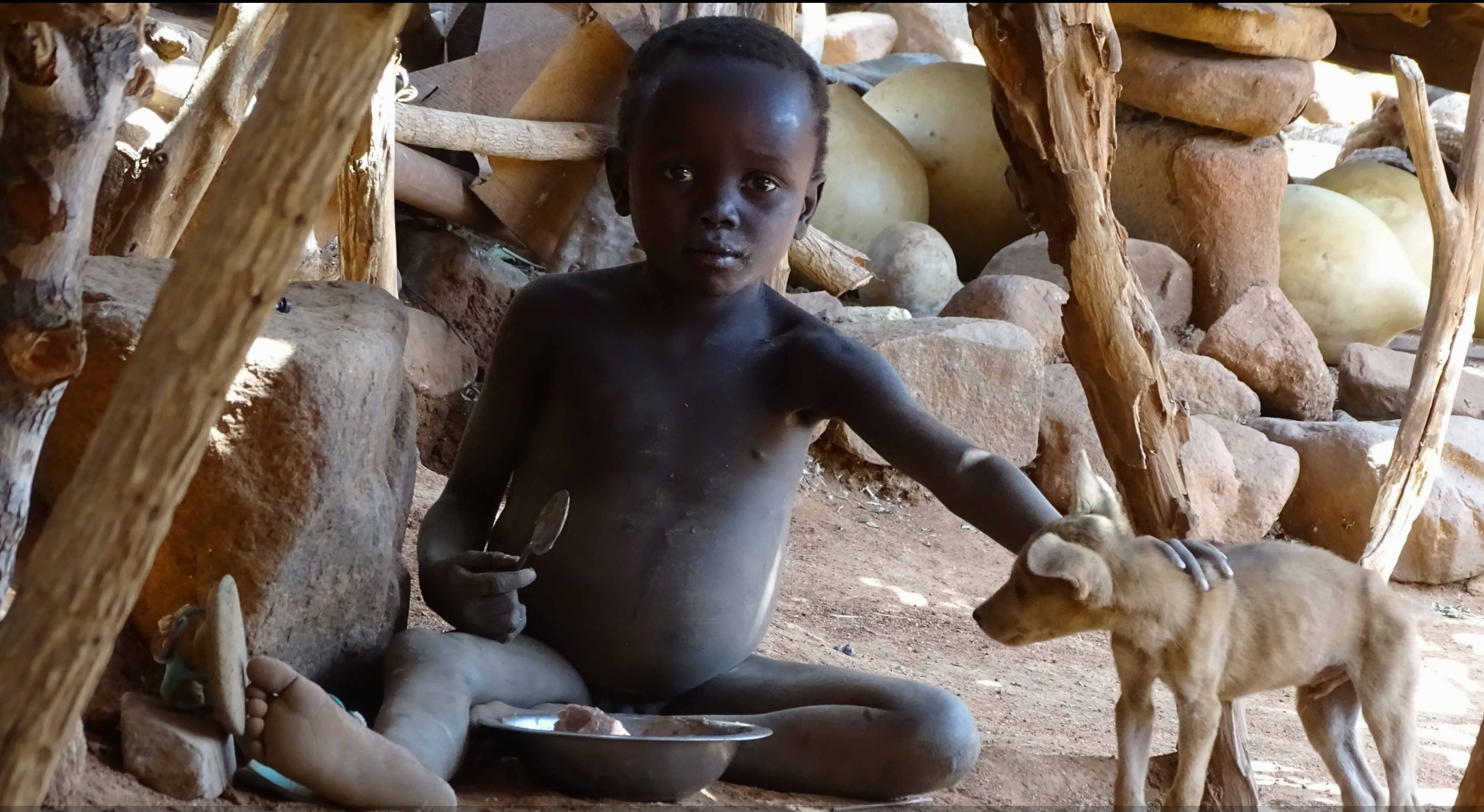
Deček med kosilom s svojim prijateljem. Boy having lunch with his friend.