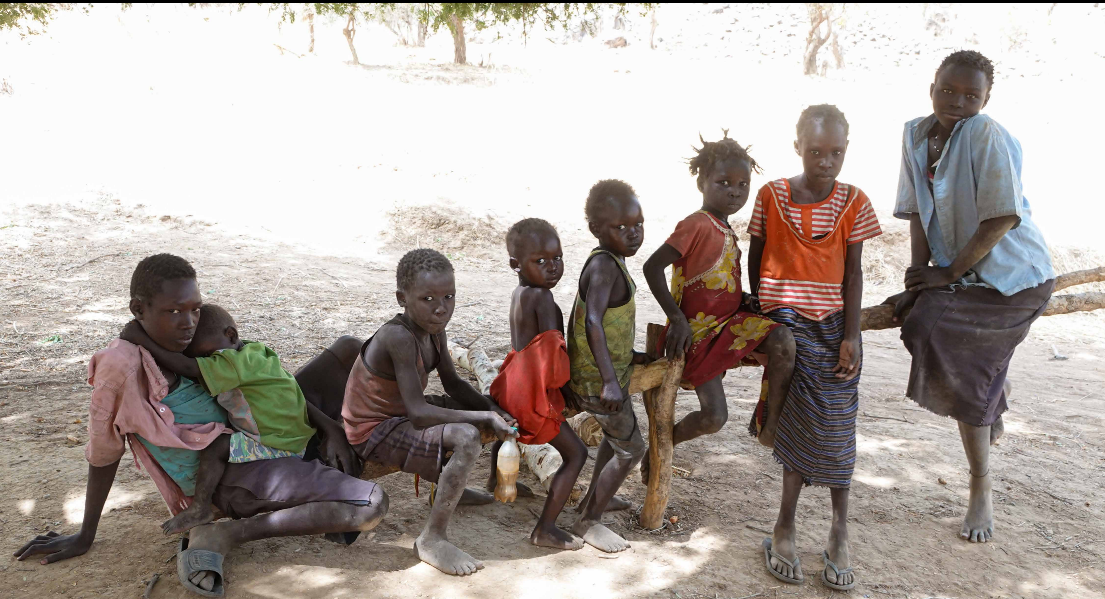
Gugalnica z otroki pod drevesom ardeb v vasi Tabanya. Gor – dol, dol – gor. »Ne vojna – ne mir!« Kaj bo prevladalo ...? Children on a swing under the ardeb tree in the village of Tabanya. Up – down, down – up. »Neither war – nor peace!« What will prevail ...?