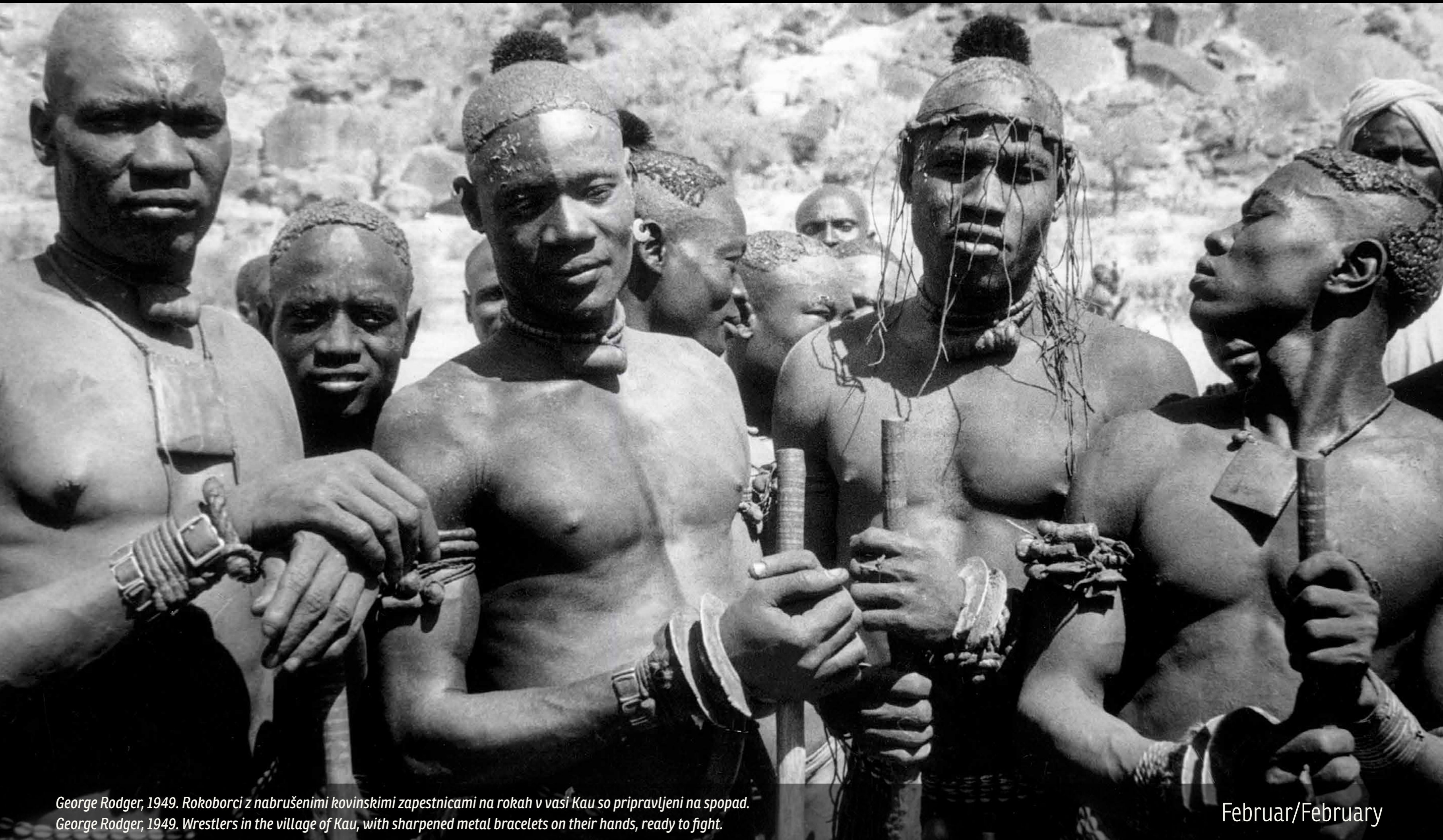
Rokoborci z nabrušenimi kovinskimi zapestnicami na rokah v vasi Kau so pripravljene na spopad. Wrestlers in the village of Kau, with sharpened metal bracelets on their hands, ready to fight.