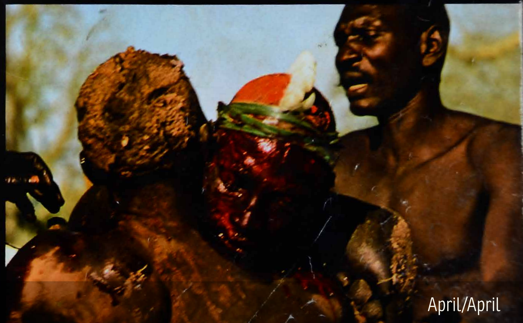
Leni Riefenstahl, 1974. Kri na rokoborbah z zapestnicami v Kau. Leni Riefenstahl, 1974. Blood in bracelet fighting in Kau.