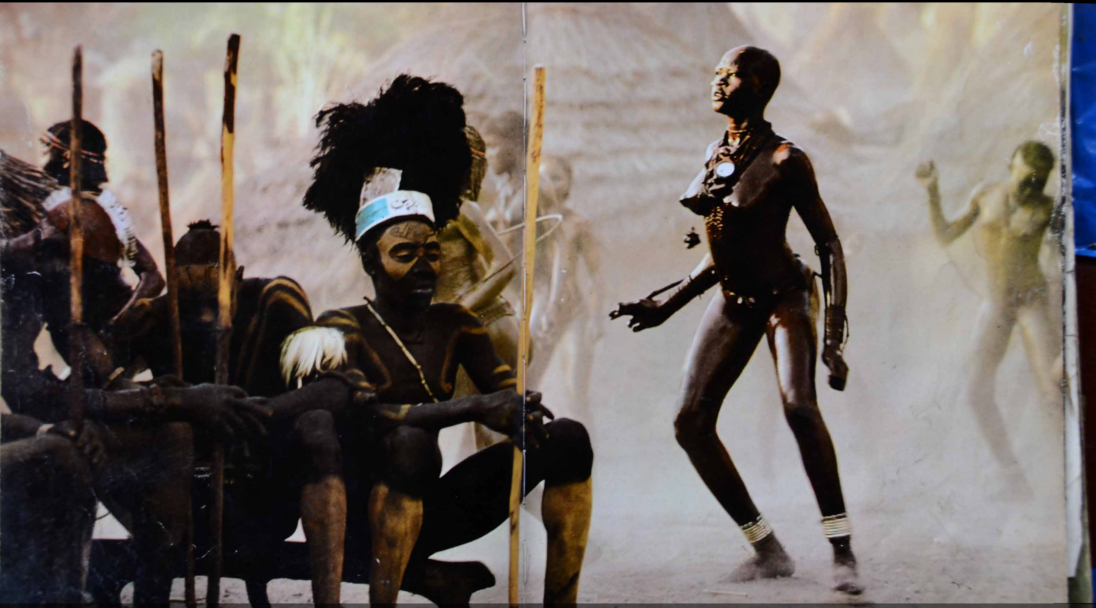
Pomerijo se tudi najbolj privlačna dekleta in s plesom ljubezni »nyerten« osvajajo najboljše rokoborce. The most attractive girls also compete and woo the best fighters with the dance of love, »nyerten«.