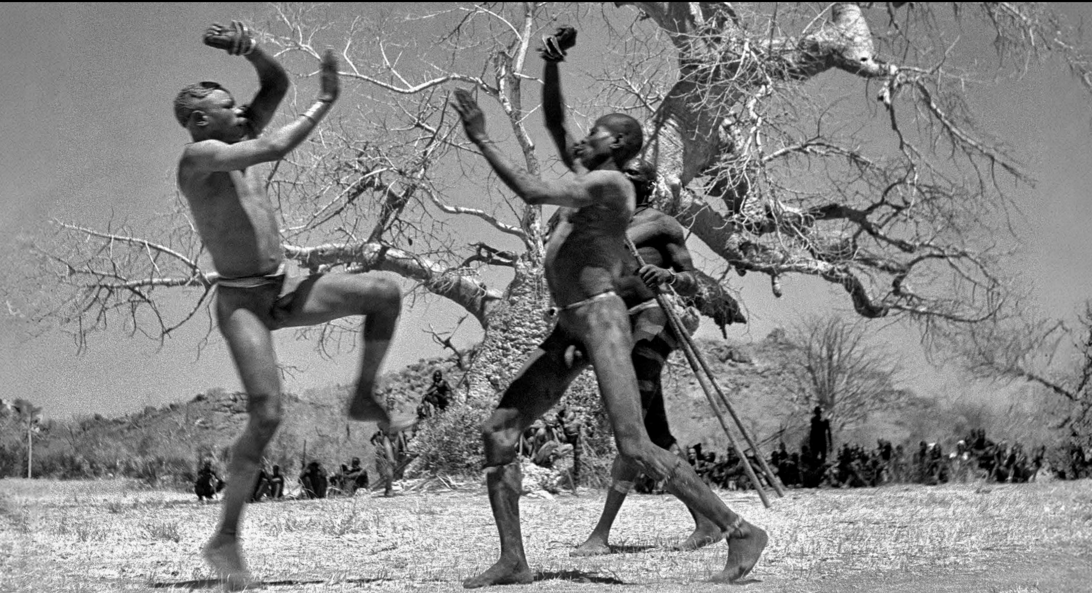
Rokoborba z kot nož ostro nabrušenimi zapestnicami v Kau. Fighting with bracelets, sharpened as knives, in Kau.