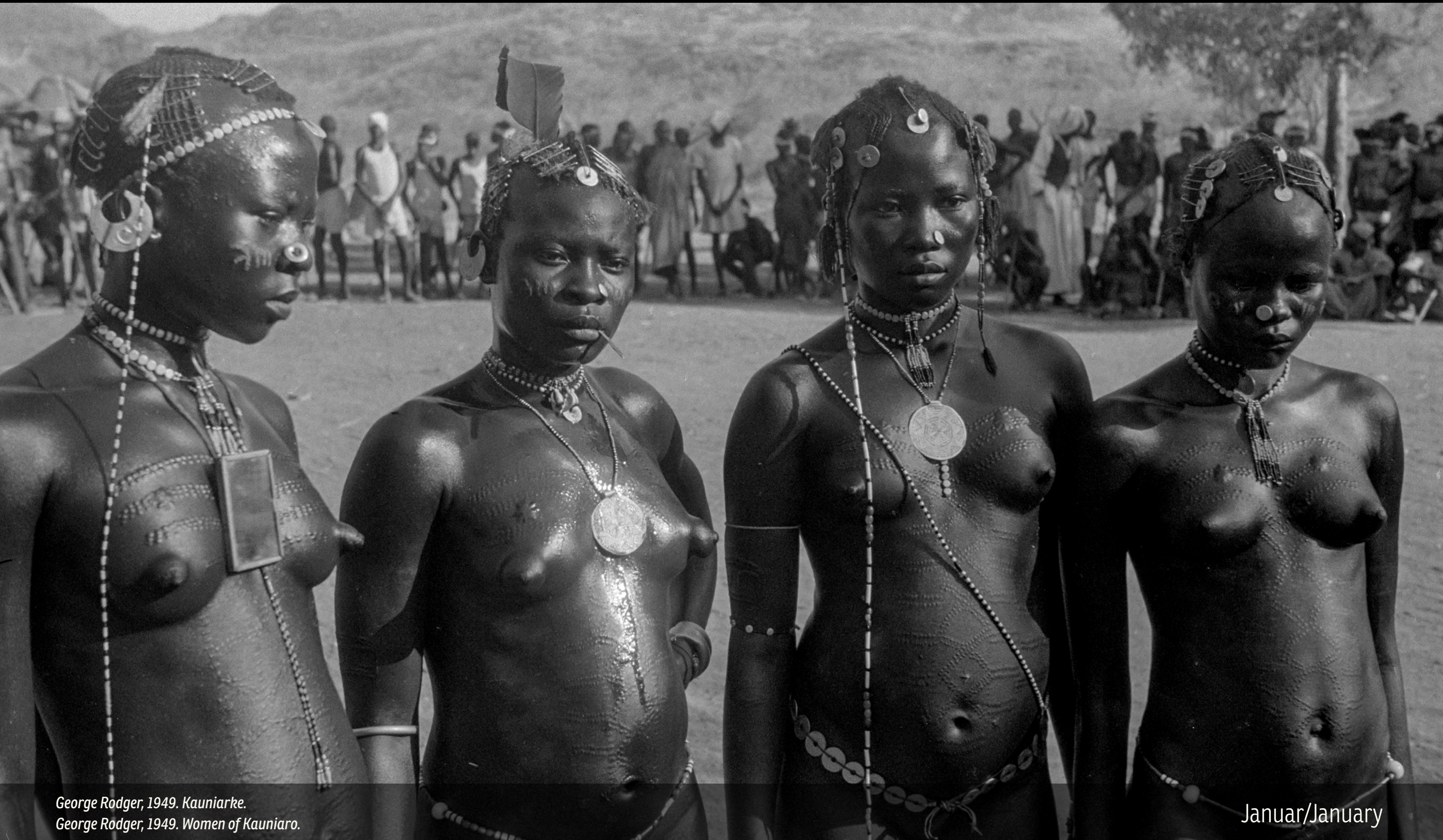
Kauniarke. Women of Kauniaro.