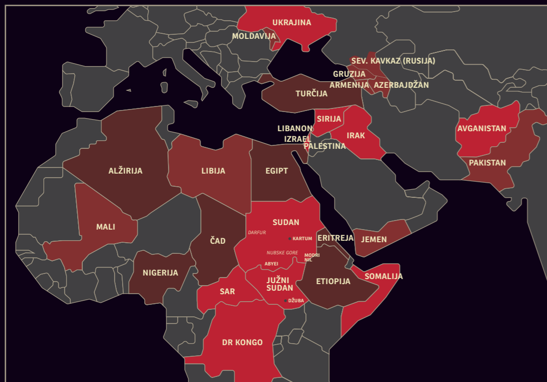
Stare kolonialne meje razpadajo. Prebežniki iz držav v vojni ali na robu vojne največ bežijo v EU. / Old colonial borders are disintegrating. Refugees from war-torn countries flee mostly to Europe.