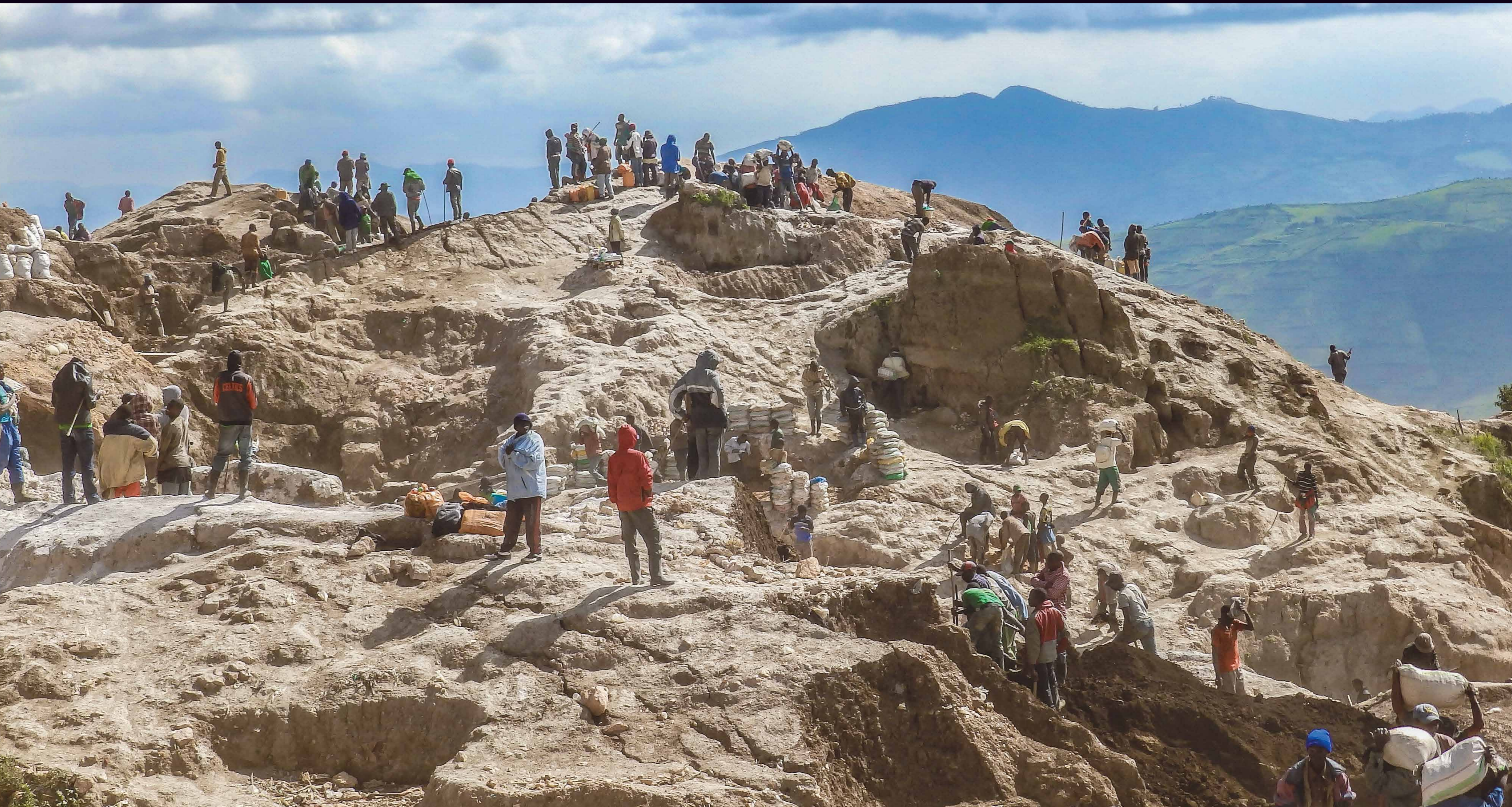
KONGO: Koltan je mineral, brez katerega digitalna tehnologija ne more. Zanj se borijo lokalne in globalne sile. Pri tem najbolj nastrada lokalno prebivalstvo. CONGO: Coltan is an indispensable mineral for the production of digital technologies. Local and global forces fight for it, always to the detriment of the local population.