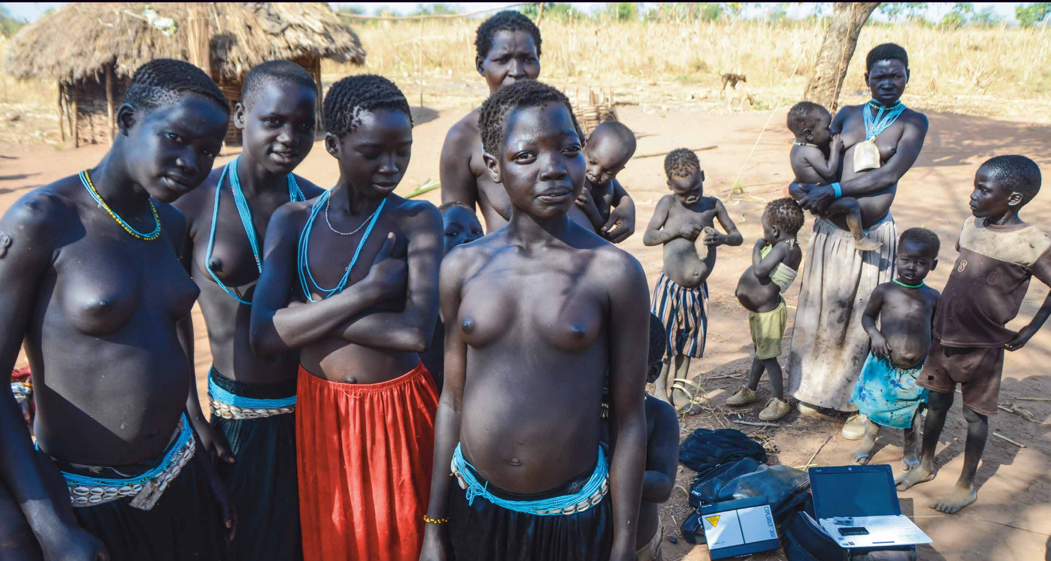
SUDAN: Dekleta iz vasi Jabous, Modri Nil, z družinami in opremo za pošiljanje posnetkov po satelitskih zvezah na svetovni splet. SUDAN: Girls from the village of Jabous, Blue Nile, with their families and equipment for uploading images to the internet through satellite connections.