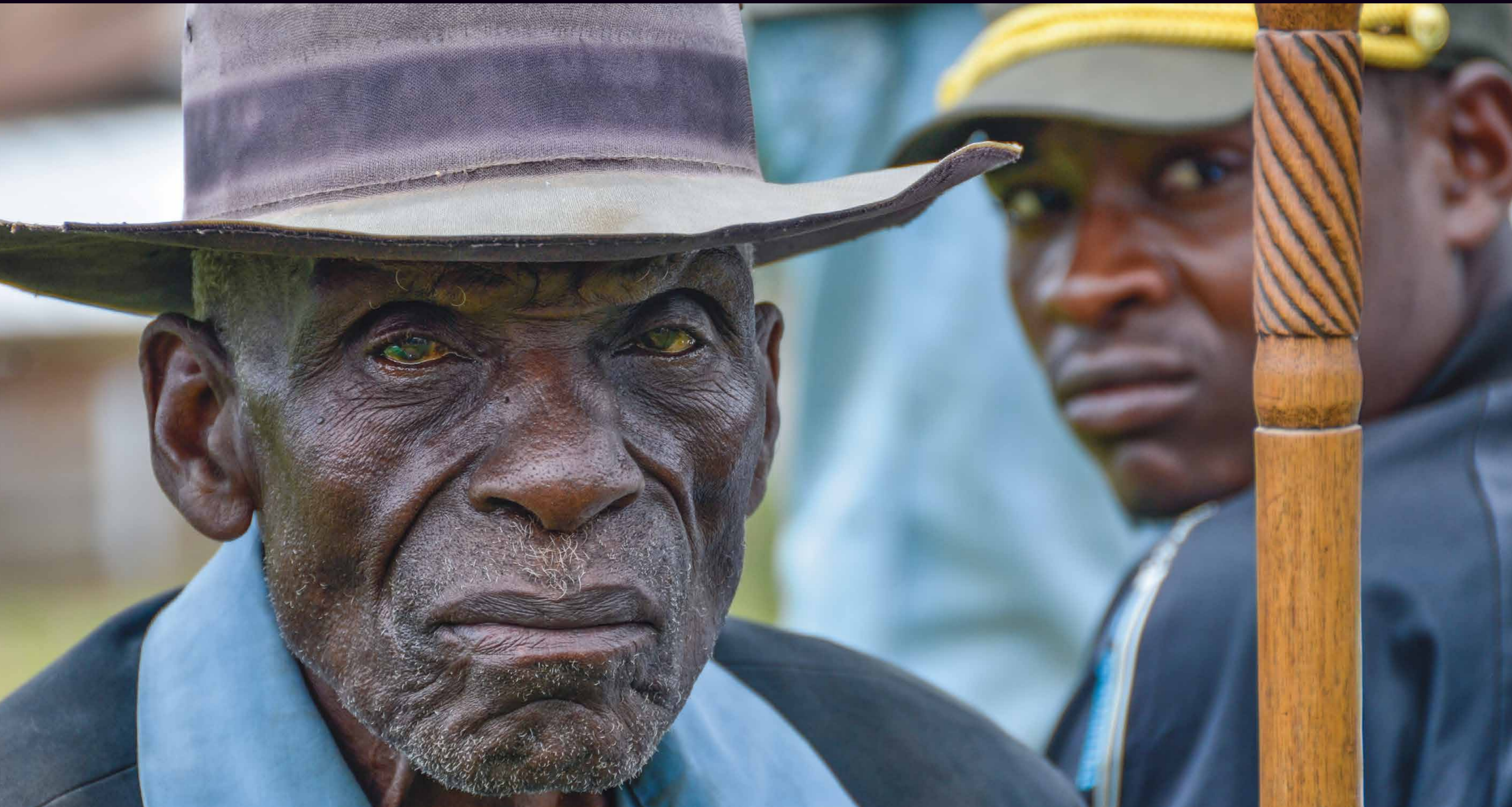
DR KONGO: Rudarji na poljih koltana v vasi Rubaya, provinca Južni Kivu. DR CONGO: Miners in coltan fields in the village of Rubaya, province of South Kivu.