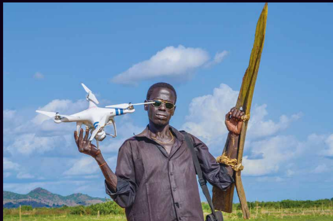
Staro orožje za iztikanje oči in novo orožje. "Oči, ki letajo in snemajo kaj dogaja". / An old weapon (for gouging out eyes) and a new weapon. "Flying eyes that see everything and can record the harm being done to indigenous people..."