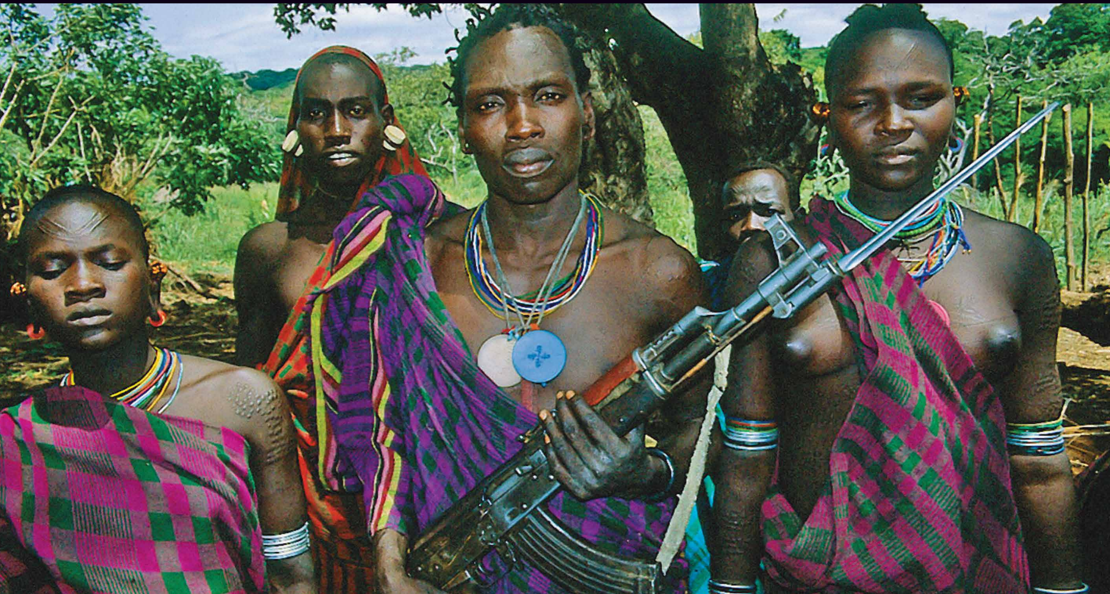
REPUBLIKA JUŽNI SUDAN: Ljudstvo Katčipo na planoti Boma ob meji z Etiopijo se brani pred domačimi in tujimi vsiljivci z orožjem v rokah. REPUBLIC OF SOUTH SUDAN: The Kachipo people in the Boma plateau on the border with Ethiopia are trying to defend themselves against domestic and foreign intruders with weapons.